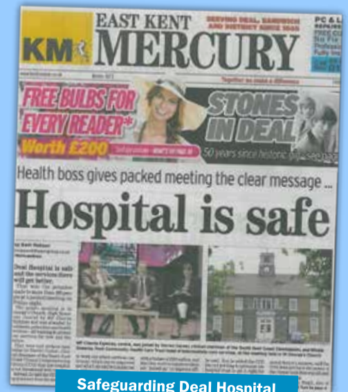
Safeguarding Deal Hospital

He is working hard to secure more local clinics and outpatient services for the most vulnerable in Deal.