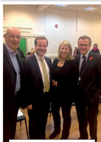
Listening to Deal traders

"The team is now engaged in plans for the whole of 2013 beginning with a French themed event in mid March."