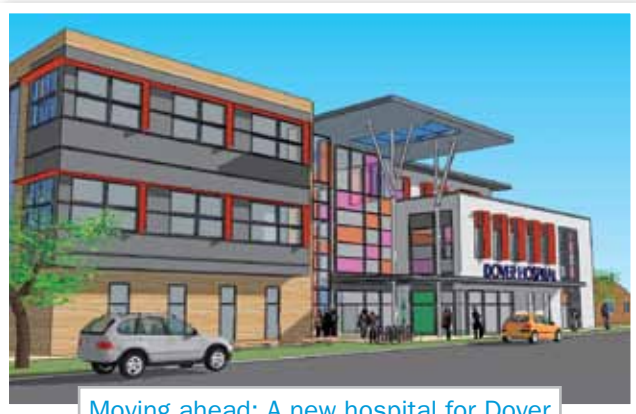
Moving ahead: A new hospital for Dover