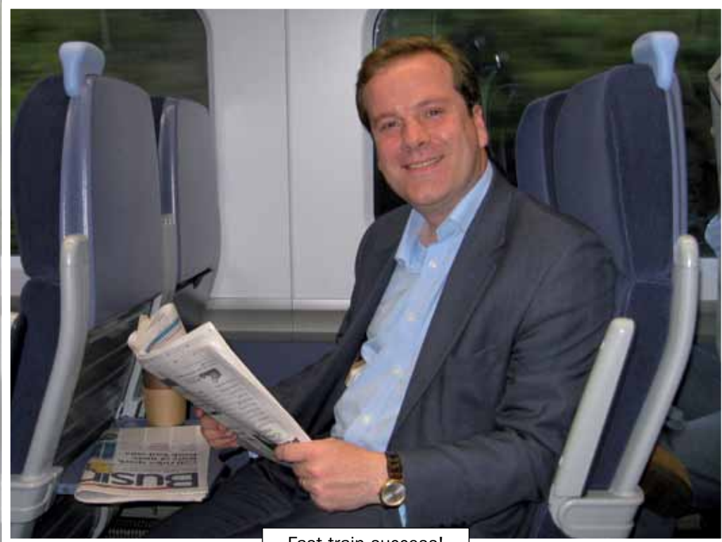
Fast train success!

More local jobs and money is a priority for us all. It's been a tough time for everyone, yet there are signs the economy locally and nationally is beginning to heal.