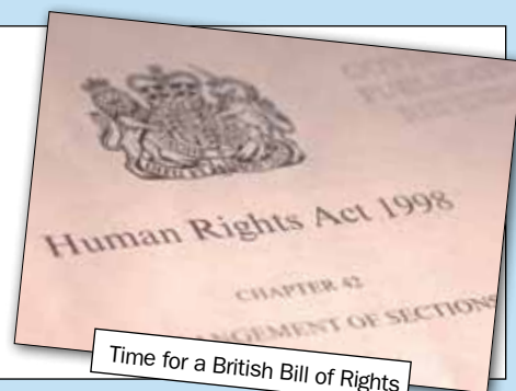
Time for a British Bill of Rights