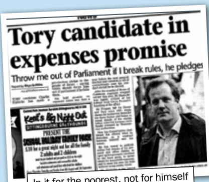
In it for the poorest, not for himself